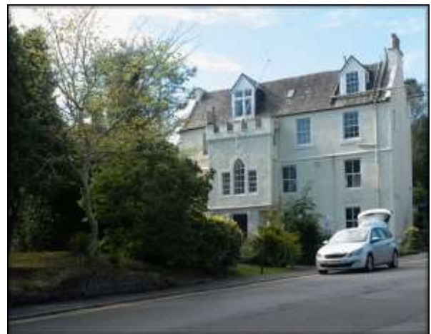
Category C Listed Building (at Risk)

Category B Listed Building with Category A Listed sundial.