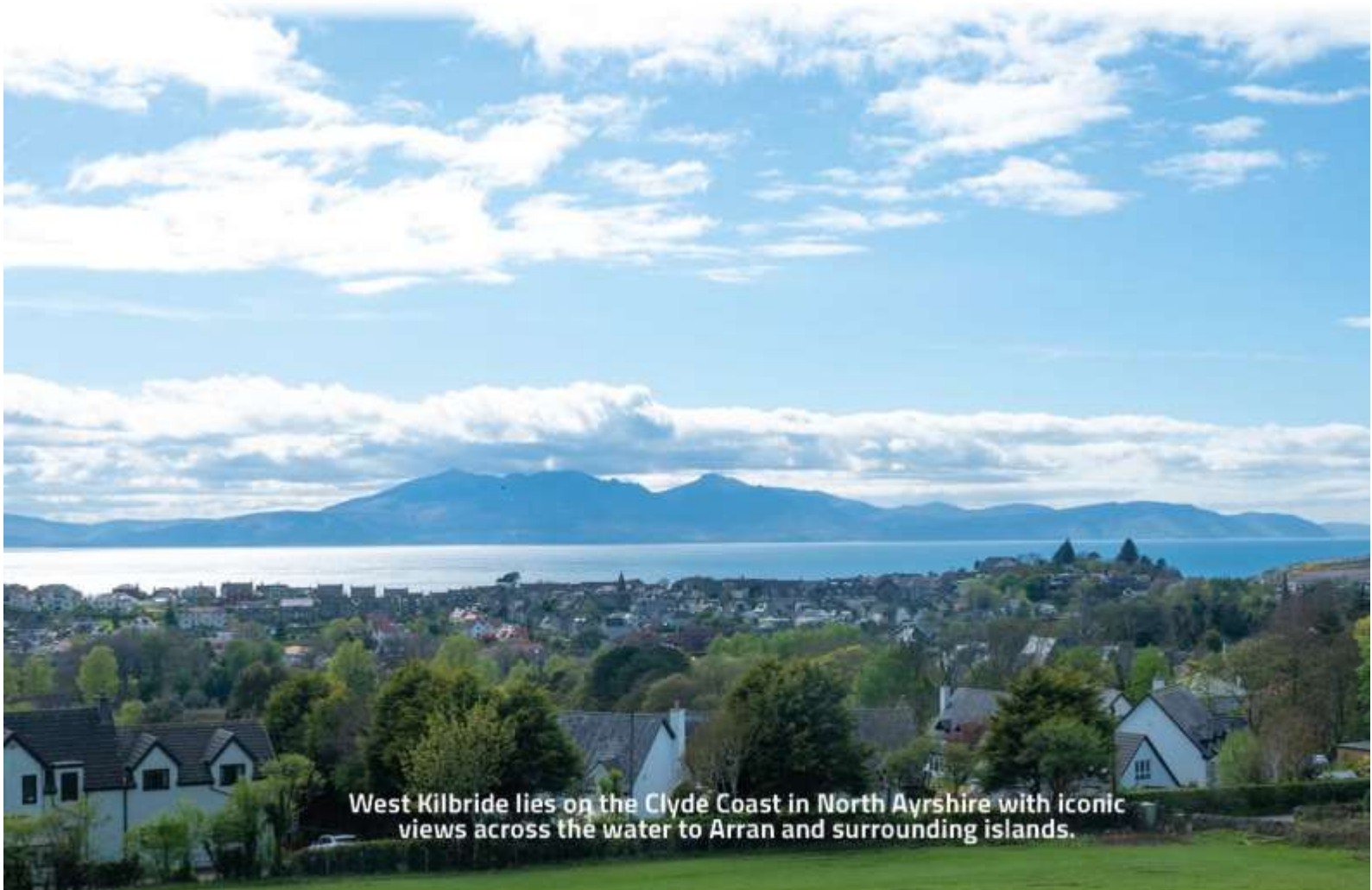
West Kilbride lies on the Clyde Coast in North Ayrshire with iconic views across the water to Arran and surrounding islands.