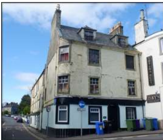
Category C Listed Building (at Risk)

73 Main Street makes a distinctive contribution to the streetscape in West Kilbride. On a prominent corner site, in the centre of the town, it formed a crucial part of the town. The unusual proportions of the widely spaced bays to the street elevations are further distinguished by the distinctive rounded corner with its quaint upswept cornice. It was a coaching inn and is described as the 'main public house in the town of West Kilbride' in the Ordnance Survey Name book. The extension to the rear is cited on the 1st Edition Ordnance Map as Wellington Hall and this was used for discussing local business or for holding public lectures. The hall was situated on the upper floor as the ground floor was used for stabling. As yet, there is no evidence for a date of construction, but it is probable that its origins may be around the turn of the 19th century