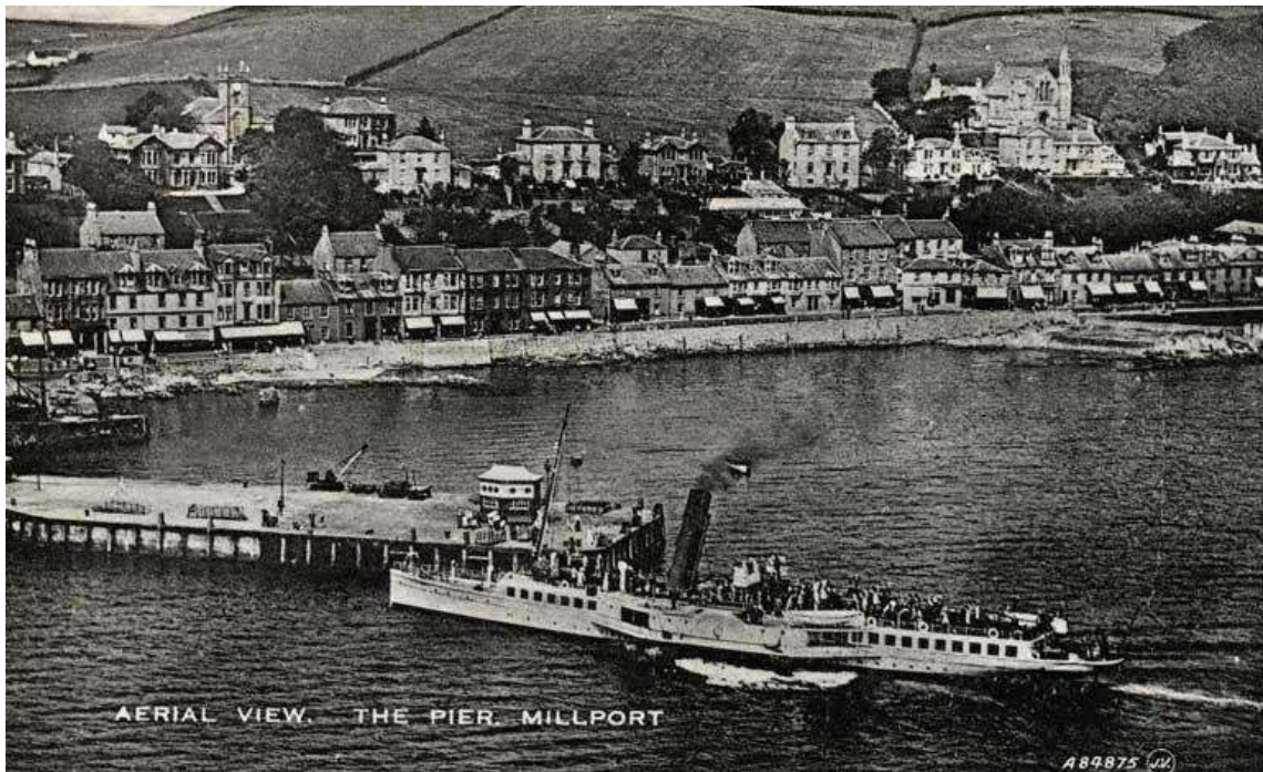
Figure 2-3: Postcard View, Circa 1921