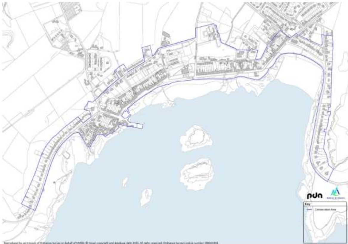
Figure 1-2: Millport Conservation Area. Baseline mapping data reproduced by permission of Ordnance Survey on behalf of HMSO. Crown copyright and database right 2013. All rights reserved. Ordnance Survey Licence number 100023393

1.15 Whilst a conservation area appraisal will help supplement the local development plan for the area, it is a material consideration when considering planning applications for new development. In that case it may be necessary for planning applications to be accompanied by a supporting statement that demonstrates how the proposal has taken account of the character of the area.