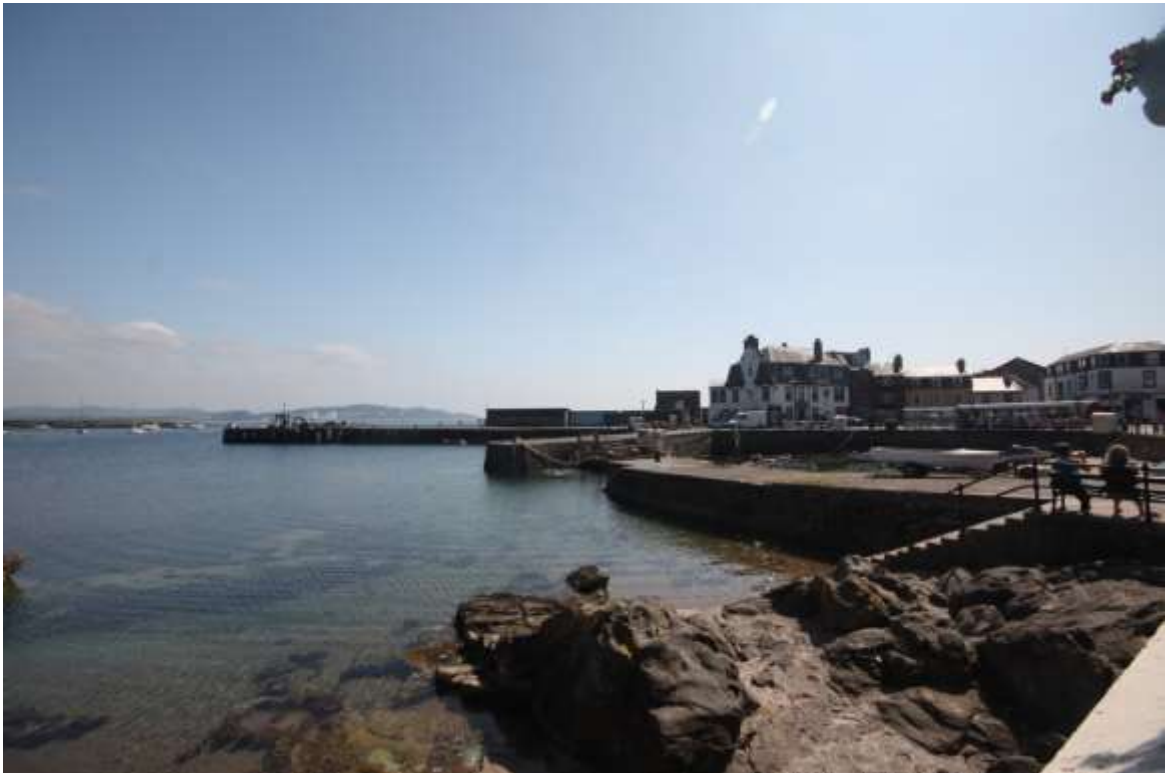
Figure 3-4: Millport Old Harbour, Quayhead and Old Pier, July 2013, PDA