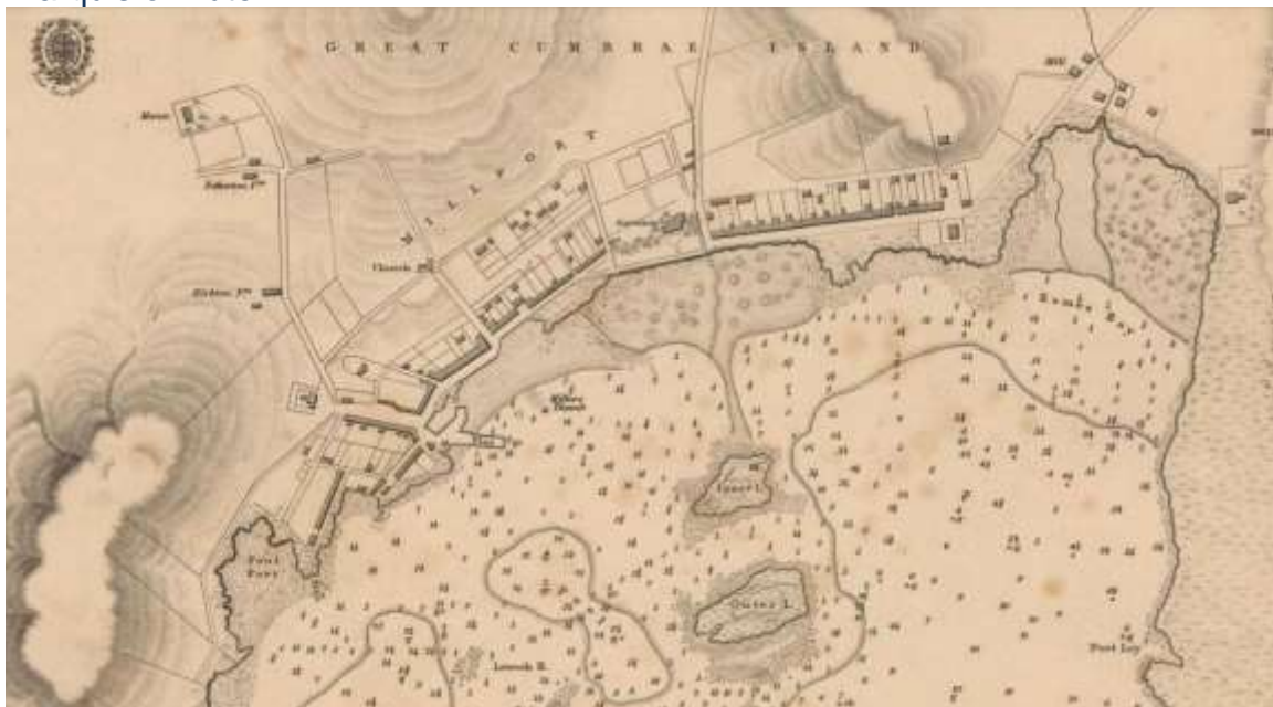
Figure 3-1: Captain Robinson's sketch of Millport 1845 © National Library of Scotland