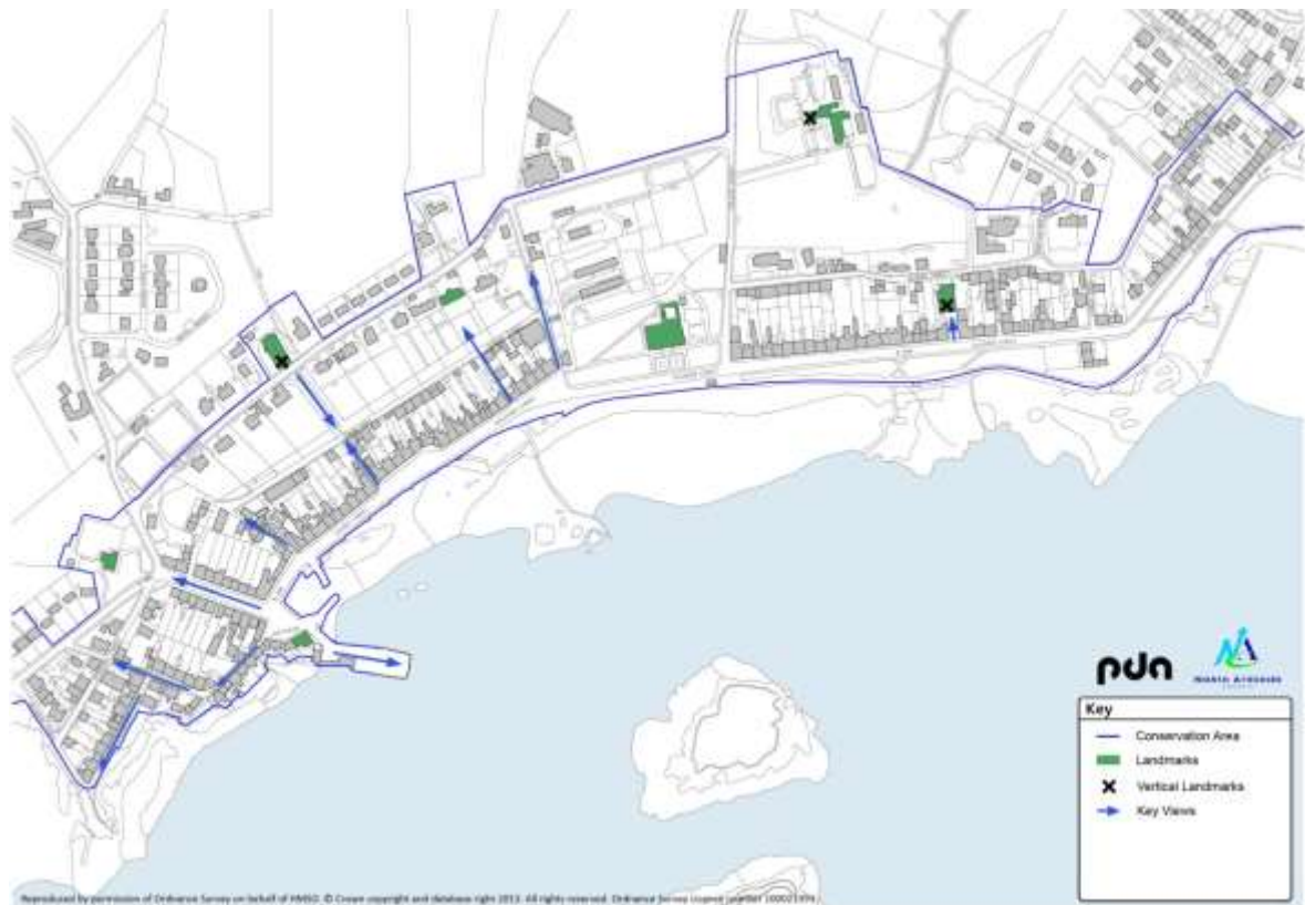
Figure 4-4: Millport Conservation Area Analysis - Key Landmarks and views