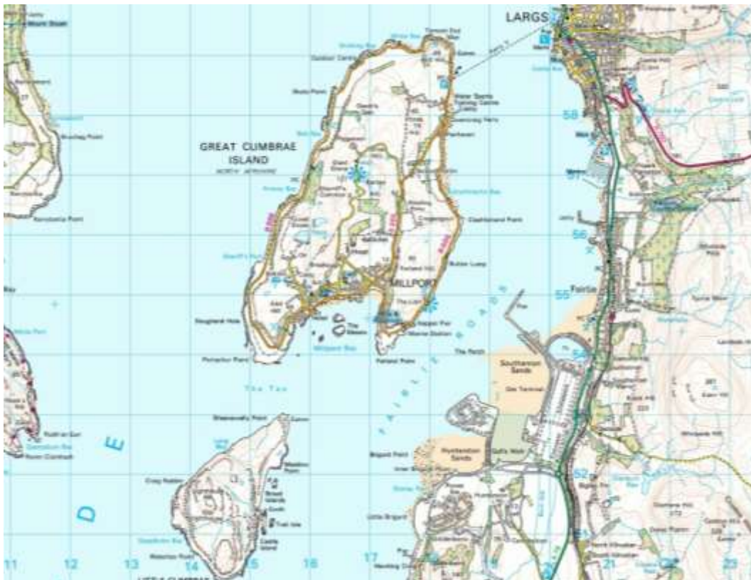
Figure 2-2: Location Plan.

As with much of the adjacent Ayrshire coastline, Cumbrae has fine examples of raised beaches. These occur perhaps most notably in the area surrounding Bell Bay - where the island's highest waterfall, Horse Falls, plunges over the old sea cliffs.