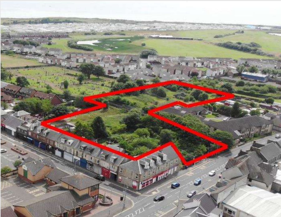
Almost a hectare of unused green space is located at the edge of the town centre.

A significant area of the town centre has been abandoned for decades (see area outlined in red in the image below). The large area of brownfield green space behind New Street and Bogelmart Street, which includes the former gas works site, is largely inaccessible to the public owing to a combination of fencing and dense scrub. To increase both public benefit and footfall in the town centre, this area should be brought into use as a community green space or car park. Green space options include community growing space and/or new green routes to and from the town centre.