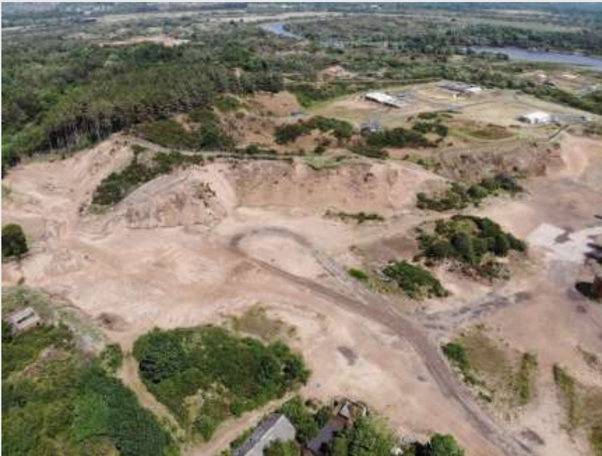
Much of Stevenston's green space has been lost to development such as sand extraction.

The town has several green spaces, including two Local Nature Reserves. Several green spaces - Ardeer Quarry, Auchenharvie, Kerelaw, Stevenston Beach, and the Ardeer Peninsula - have formal path networks that provide visitors with a variety of walking routes. Green space accessibility has significantly declined in recent years, with most of the town's largest green space, the Ardeer Peninsula, being fenced-off from the public by one of the landowners. The town suffers from an ongoing reduction in quality and area of green space. For example, the Ardeer Peninsula has suffered from large-scale habitat destruction in the form of woodland clearance and commercial sand dune removal, and farmland between the towns has gradually been lost to built development.