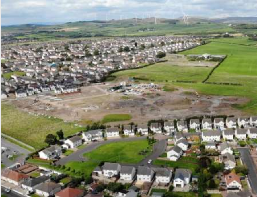
Almost 400 new homes are being constructed by Persimmon at the eastern edge of Stevenston.

Over 800 new homes will be constructed over the next decade between two large housing developments at Mayfield Farm, which is just within the western boundary of the town, and West Byrehill Industrial Estate, which is just beyond the eastern boundary of the town. The huge amount of housing to be built within the next few years coupled with the projected fall in occupied households in the local area means that further loss of countryside to housing is unnecessary as well as undesirable.